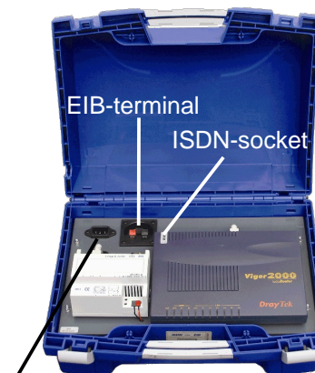
power supply 230V AC

The router is preset as a DHCP server. The range of client addressing is 192.168.0.100 - 200