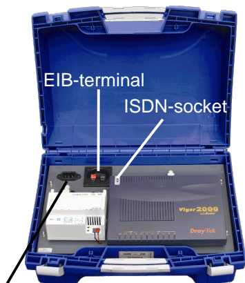
power supply 230V AC

The router is preset as a DHCP server. The range of client addressing is 192.168.0.100 - 200